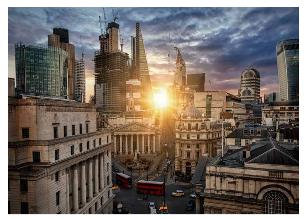
Written March 2020

Financial advice and regular reviews are essential to help position your portfolio in line with your objectives and attitude to risk, and to develop a well-defined investment plan, tailored to your objectives and risk profile.